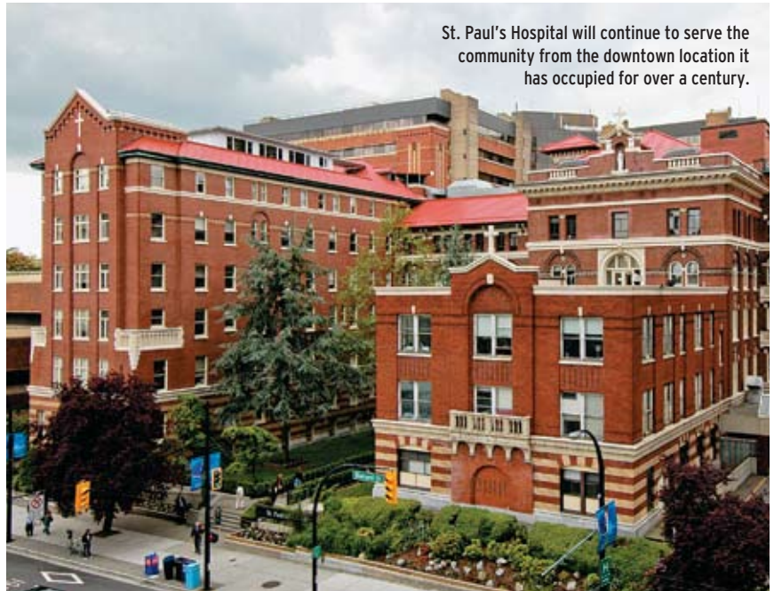
St. Paul's Hospital will continue to serve the community from the downtown location it has occupied for over a century.

looking forward to partnering in plans to renew the hospital's facilities and keep it on the cutting edge of care, research and teaching. While redevelopment plans have not been finalized with the Ministry of Health Services, Providence Health Care (PHC), which operates St. Paul's, is working with its partners in developing its concept plan for the hospital.